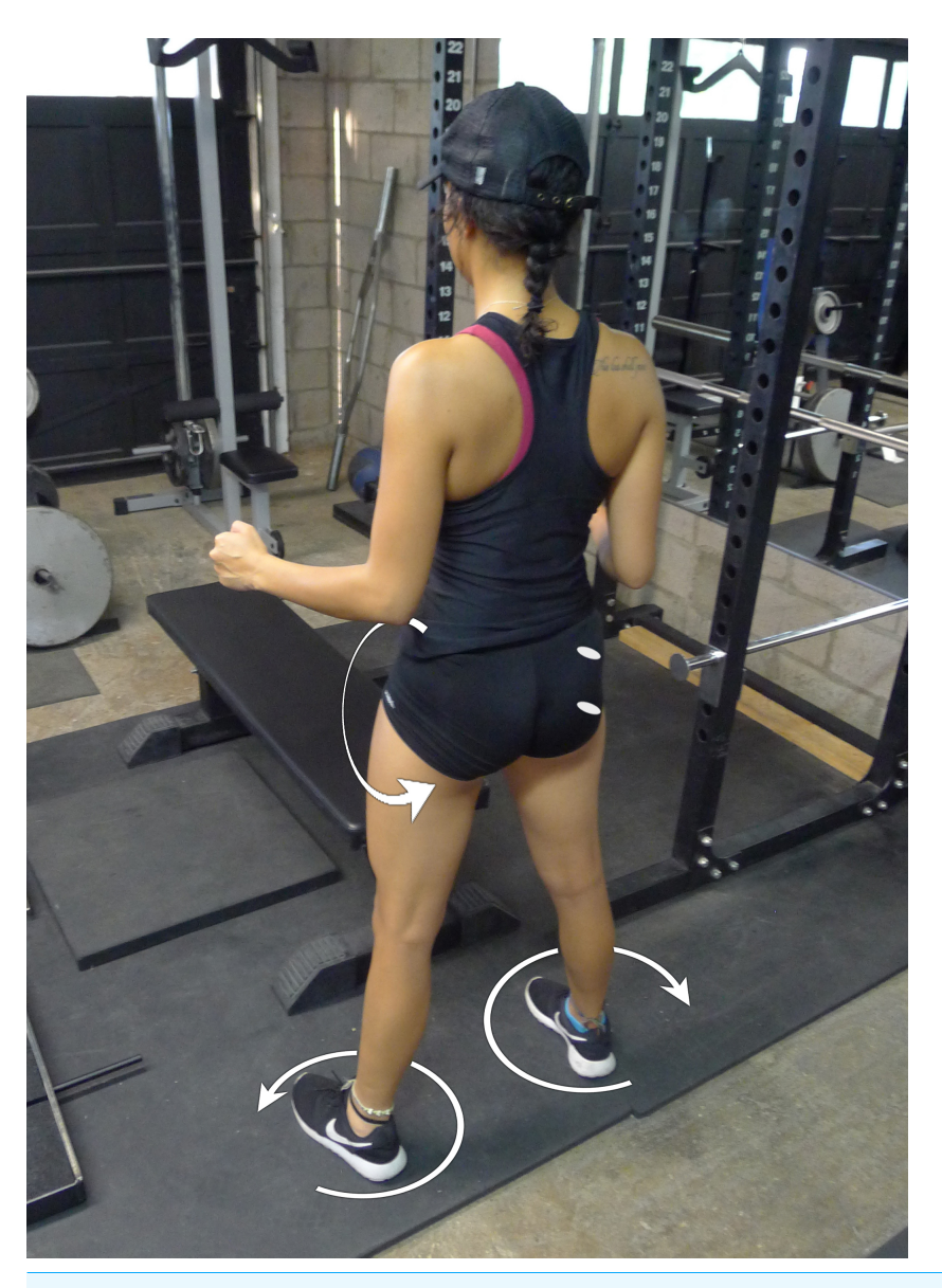
Figure 2 Standing glute squeeze. The subject squeezes her glutei, which generates hip extension and external rotation moments.