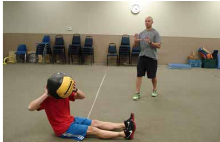
Figure 16. Seated Shoulder Thrusts