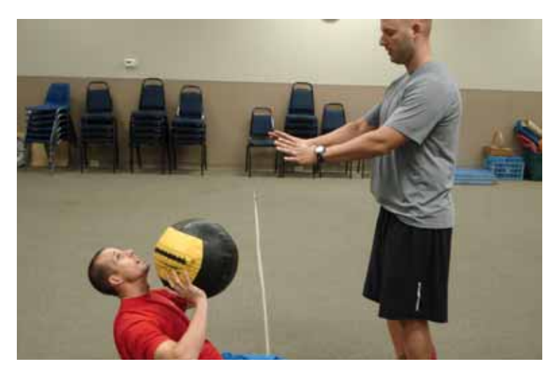
Figure 18. Seated Isometric Chest Press