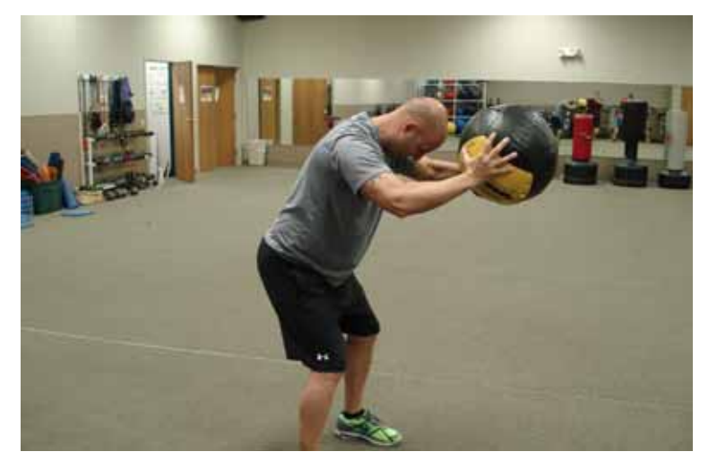
Figure 15. Standing Axe Chops