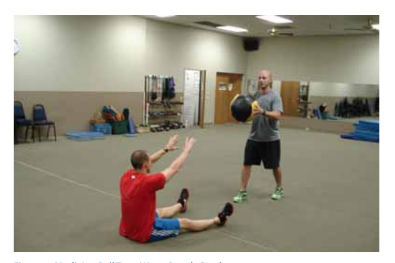
Figure 9. Medicine Ball Toss / Knee Punch Combo