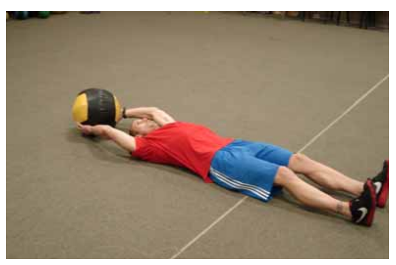
Figure 2. Medicine Ball Toss

5. Williams, C. Core training using a domed device. NSCA Performance Training Journal 7(6): 9–12, 2008.