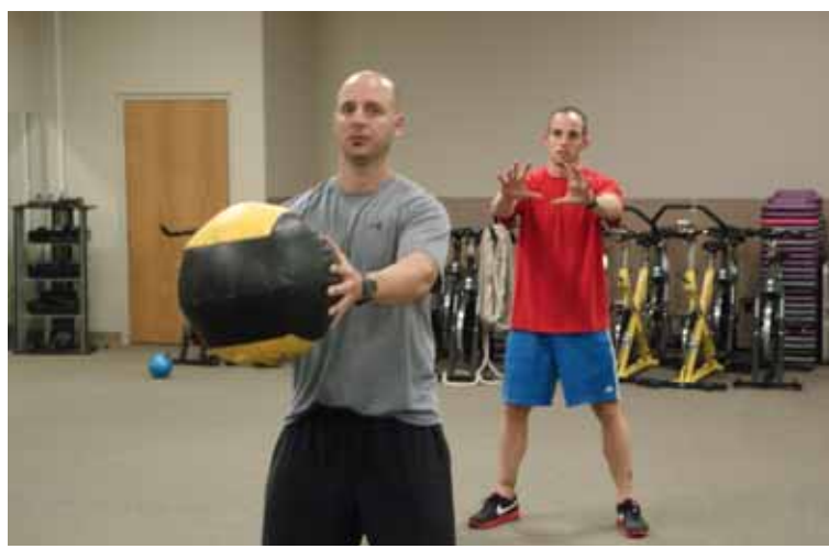
Figure 10. Standing Rotations