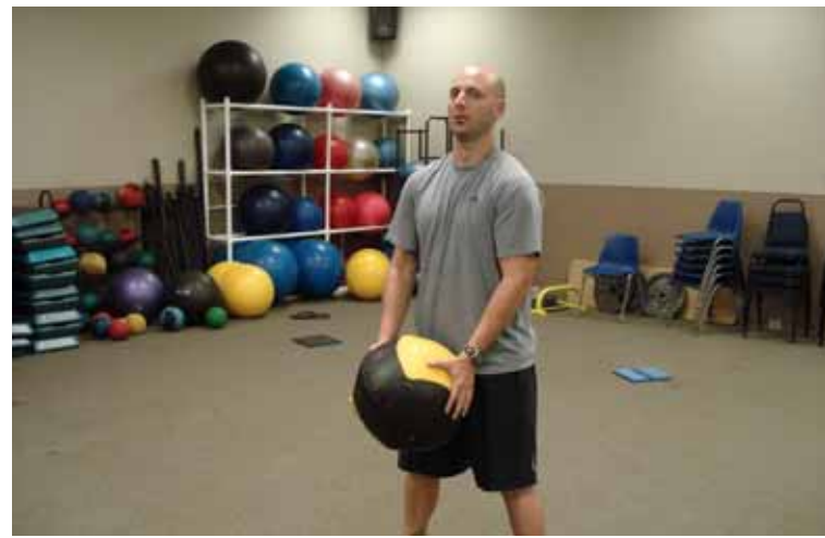
Figure 12. Standing Axe Chops