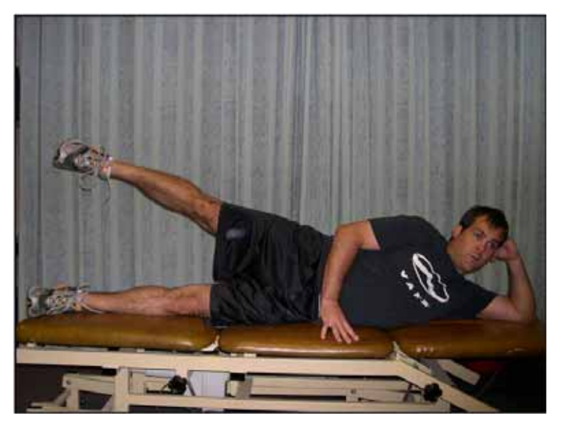
Figure 3. Side-lying Hip Abduction