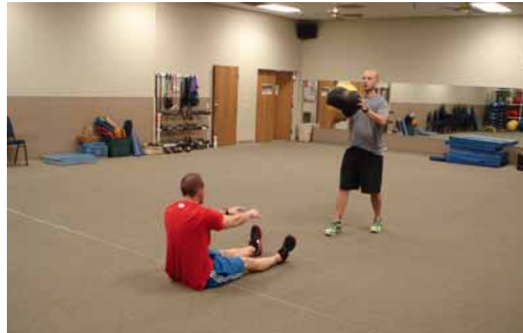
Figure 4. Medicine Ball Toss