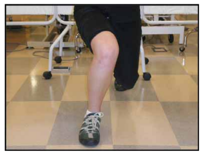
Figure 1. Medial Collapse of Leg During the Lunge