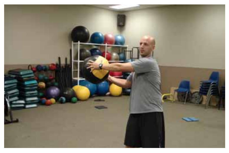
Figure 13. Sanding Axe Chops