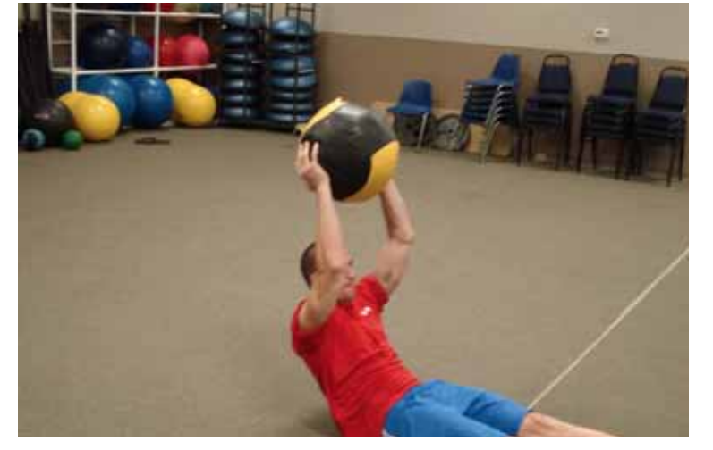
Figure 3. Medicine Ball Toss