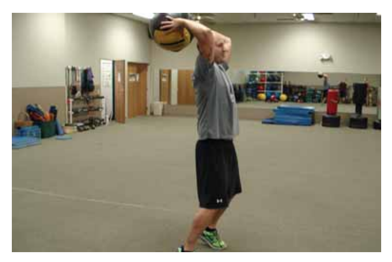
Figure 14. Standing Axe Chops