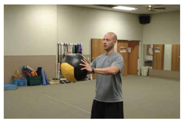
Figure 1. Catch and Return

A few questions must be answered before integrating the medicine ball into a training program. What is the current fitness level of the individual? What are the training goals? What size of medicine ball should be used? If the goal of the individual is to increase power then performing 3–5 repetitions with a heavier medicine ball relative to their fitness level would be the correct volume. If they want to improve muscular endurance then ball performing 12–15 repetitions with a lighter medicine ball would be the preferred volume (Table 2). A medicine ball circuit can be created by combining five of the previous exercises; this is a fun and challenging way to work the core. The medicine ball toss, shoulder thrust, seated rotation, isometric chest pass, and isometric overhead press are the five exercises in the circuit for the purpose of this article. The basic circuit has a total of 13 exercises and totals 39 repetitions (Table 3). The intensity and volume of the core circuit can be increased by modifying the weight of the ball and the repetitions completed (Table 4).