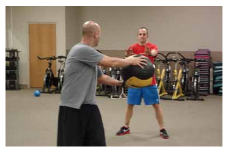
Figure 11. Standing Rotations