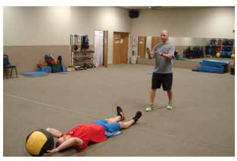
Figure 6. Medicine Ball Toss / Knee Punch Combo