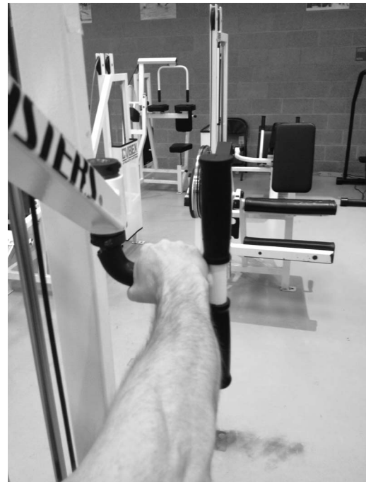
Figure 1. Pronated hand position (PRO).

initial warm-up consisting of 5 minutes of light cardiovascular exercise and slow dynamic stretching in all 3 cardinal planes, subjects were asked to slowly increase the force of the contraction so as to reach a maximum effort after approximately 3 seconds. Subjects then held the maximal contraction for 3 seconds before slowly reducing force over a final period of 3 seconds. This procedure was repeated once for each muscle after a 60 second rest interval and the highest MVIC value was used for comparison.