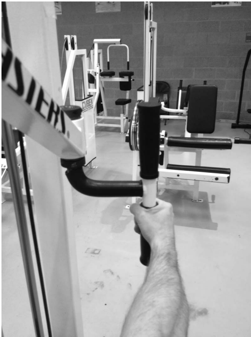
Figure 2. Neutral hand position (NEU).